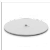
Round Base with VHB tape -RD