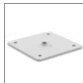
Square Drill Down Base -DD