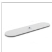
Racetrack Base, with non-skid -RT