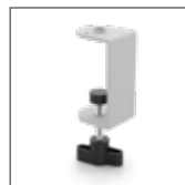
"C" Clamp-On Base -CL

End Uprights sold in pairs. For wider spans, add Center uprights, CBSHR-SS Series include 2 side uprights with headless set screws and laser cut steel bases. Note: Does NOT include the Acrylic shield.