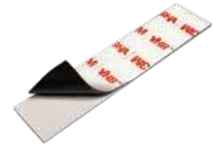
High Bond Tape is supplied to hold graphics to StandOff Mounts.