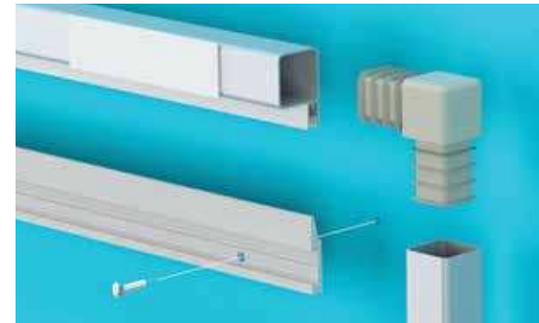
Floating StandOff Mount hangs from wall cleat.