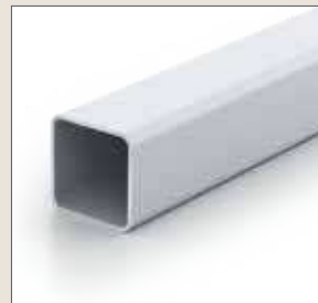
1" square aluminum, quick, tool-free assembly.