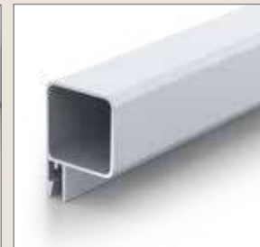
Top section hangs from wall cleat.