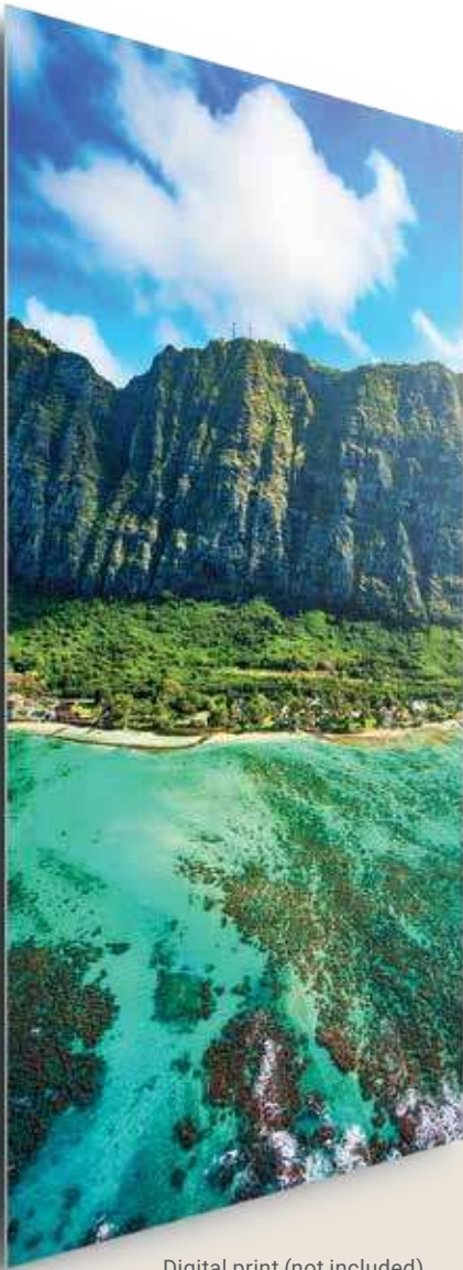
Digital print (not included), attached to StandOff Mount.