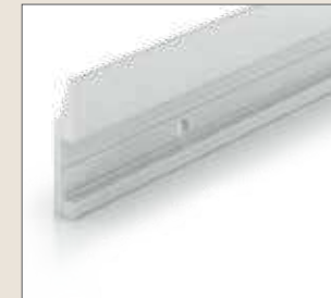
Wall mount cleat includes mounting holes.

Security options available to "lock" frame to wall.