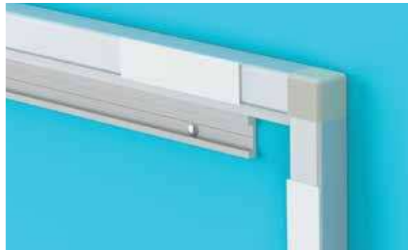
Graphic attaches to StandOff Mount with High Bond Tape.