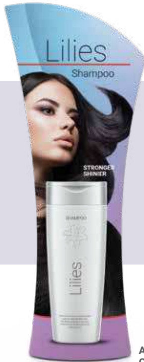
APA1 with GFX-APA