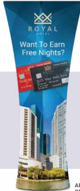
APF1 with GFX-APF