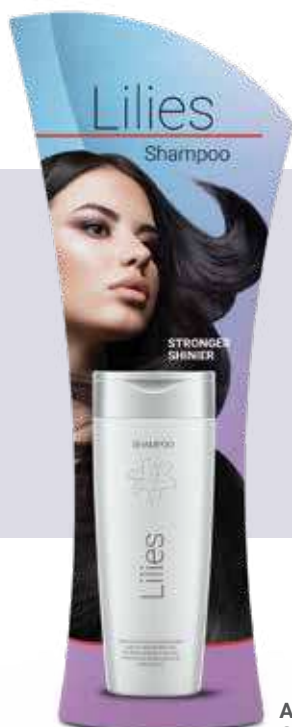
APA1 with GFX-APA