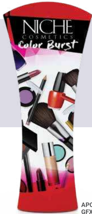
APC1 with GFX-APC