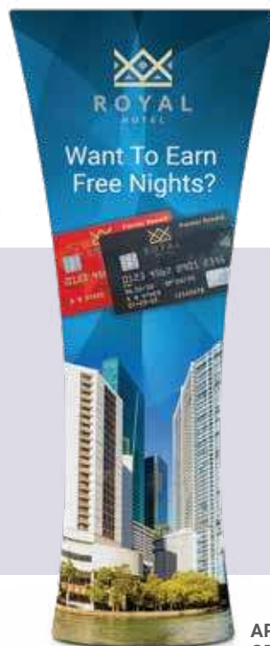
APF1 with GFX-APF