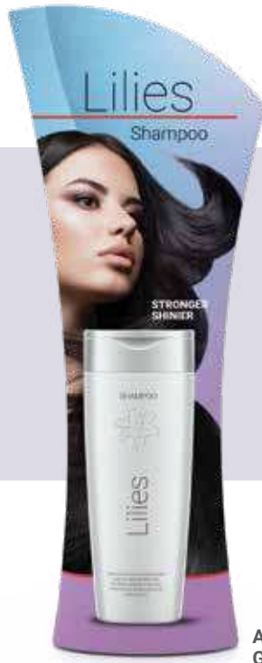
APA1 with GFX-APA