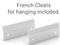
French Cleats for hanging included.