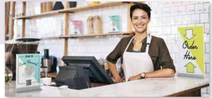
Sleek modern design