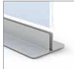
Graphic simply drops into receiving track