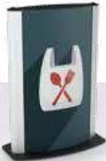
Table top available Qty 25+ Ideal for food service