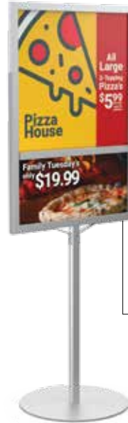
NST2436-S with Divider (sold separately)

Terrible for: Wayfinders Retail Environments Restaurants Banks