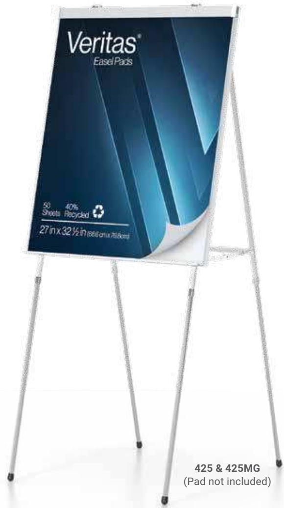
425 & 425MG (Pad not included)

Trouble-free clutch mechanism for secure locking.