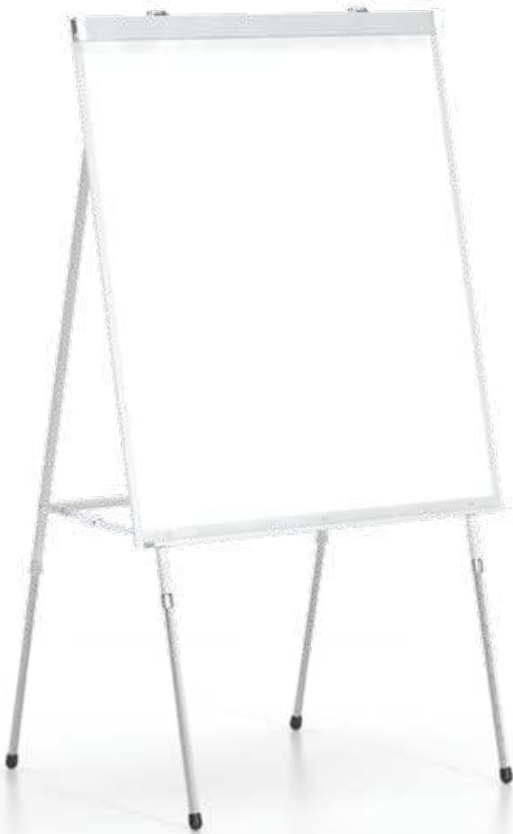
425 & 425MG Intermediate position