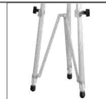
Legs telescope, and easel folds together.

...A great alternative to more costly aids and techniques.