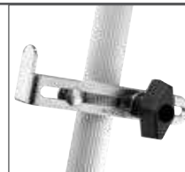
Patented metal chart holders.