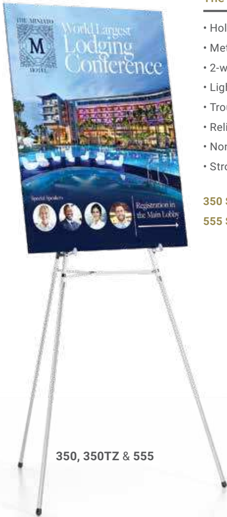
350, 350TZ & 555

EBG-X Easel bag for any easel on this page.