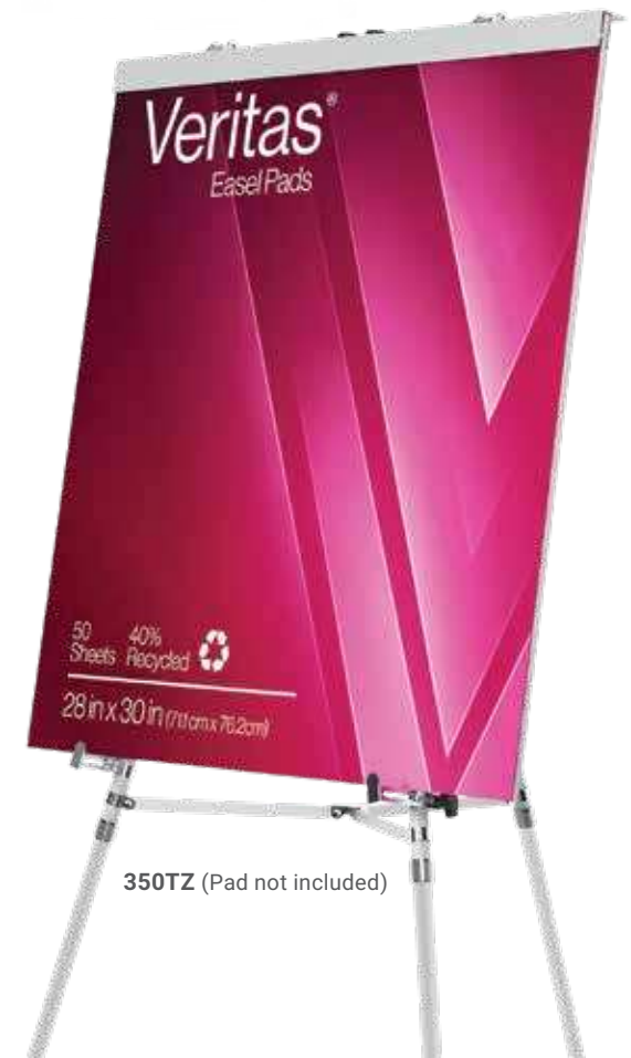
350TZ (Pad not included)