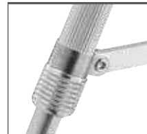
Trouble-free clutch lock mechanism.