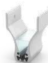
VCWM Features hole for mounting parallel on a wall.