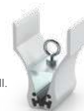
VCCD Clamp has integral eye hook for ceiling drops.