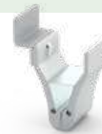
VCMSW Mini Clamp with slot wall bracket.