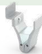
VCMSW Mini Clamp with slot wall bracket.