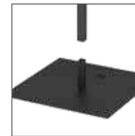
Steel support bushing