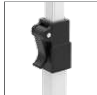
Square steel tubing with innovative lock