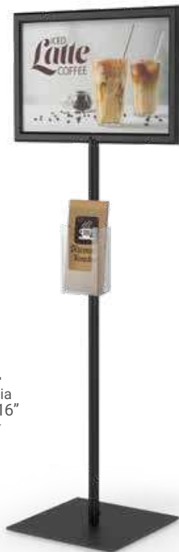
SF5S-SQ-X-H-B with LHP-C-1 Pamphlet Holder