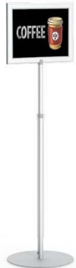
SF3S-RD-TP-H-S Shown with WES8511 wet erase insert (printing not included).