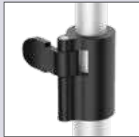
"G" Lock allows quick height adjustments.

Tremendous value & still made in the USA!