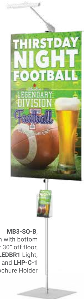
MB3-SQ-B , Shown with bottom holder 30" off floor, LEDBR1 Light, and LHP-C-1 Brochure Holder