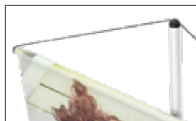
Diamond braided rope fits slot in dome shaped cap.