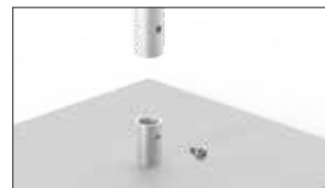
Inner bushing ensures stability of 12" square base.