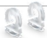
universal hanging clips