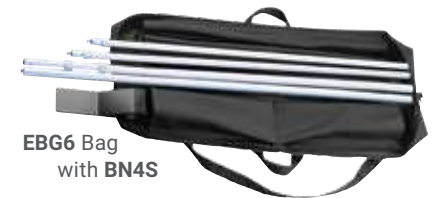
EBG6 Bag with BN4S

EBGC 22" x 4" x 3" bag for Cascade Lights only.