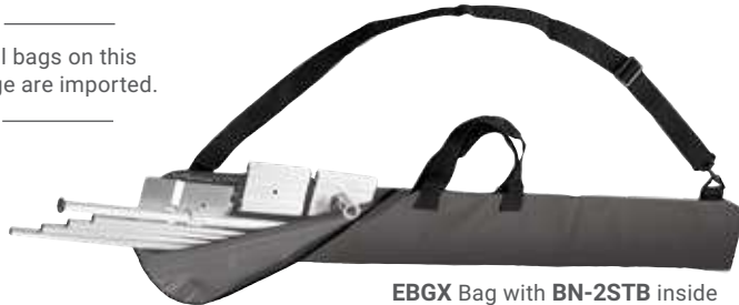
EBGX Bag with BN-2STB inside